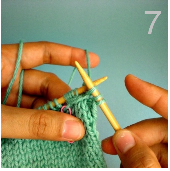
Knit the loop together with the first stitch on the left hand needle