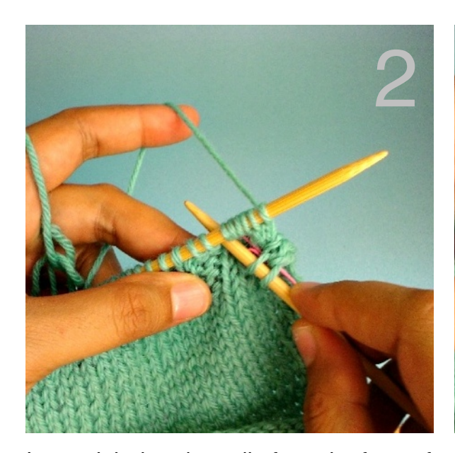
Insert right-hand needle from the front of Preparing to pull up a loop the work, between the 6th and 7th stitches on the left-hand needle.

SI 1, p1 completed. Paper clip used as a stitch marker placed in stitch 6 (count stitches remaining on left needle after p2 completed); right needle will be inserted to the left of the paper clip marker.