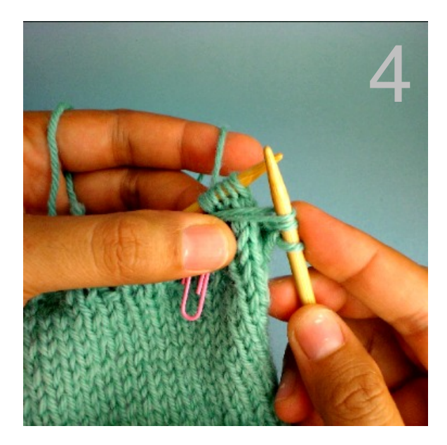
Pulling up a loop