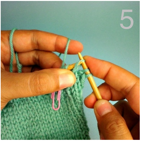
Slip this loop onto the left needle